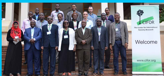
RCMRD Participates in OFESA Project Kick-off Workshop