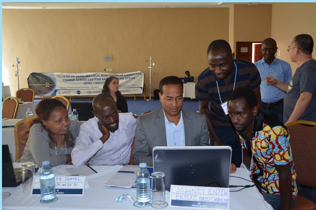
Participants during the capacity building and reference data collection activity in Entebbe, Uganda.