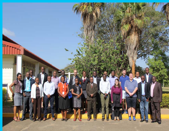
RCMRD Holds Training Workshop on the Ensemble Framework for Flash Flood Forecasting.