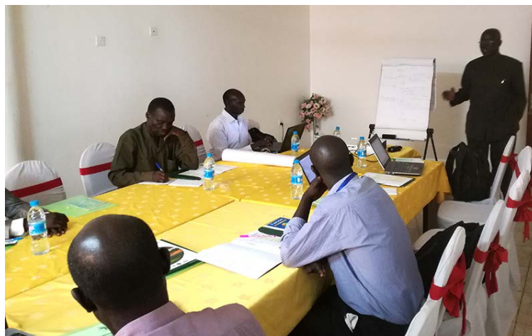
Training on land degradation in Juba, South Sudan.

The participants were drawn from various ministries and institutions in South Sudan.