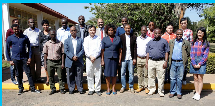
RCMRD Holds Global Land Cover and Bamboo Mapping Training.