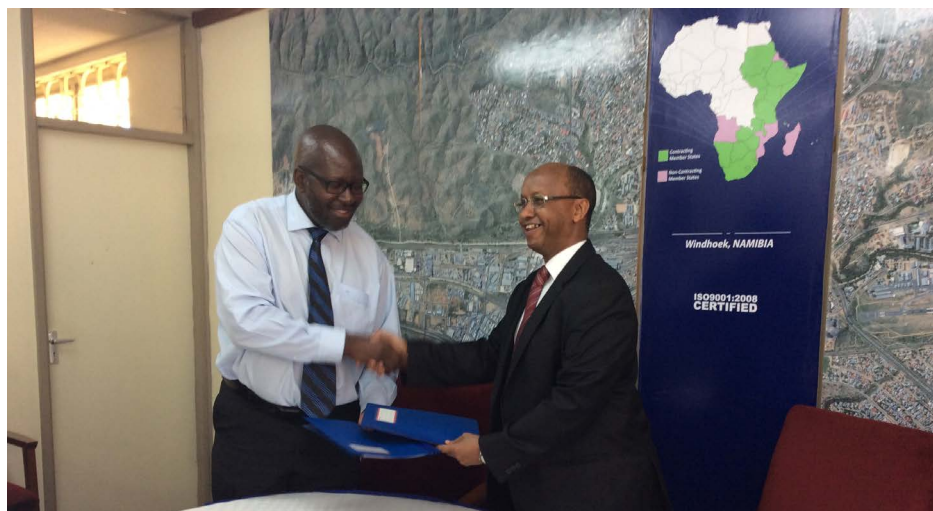
Signing of the MOU between RCMRD and AFRALTI

AFRALTI is a regional institution which provides capacity building programs to the ICT industry in Africa with the aim of harnessing the socio-economic development of African Countries.