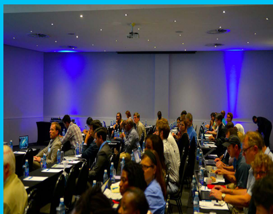
RCMRD Attends 5th International Conference on Climate Services in Innovation and Capacity Building.