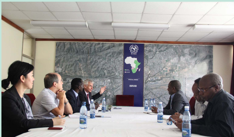
Meeting on exploring areas of collaboration between RCMRD and IUCN.

IUCN is the universal authority on the status of the natural world and the measures needed to safeguard it.