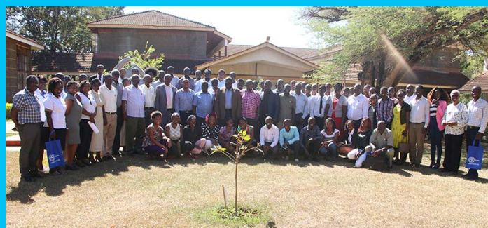
RCMRD Holds Data Sensitization Workshop at Jaramogi Oginga Odinga University of Science and Technology.