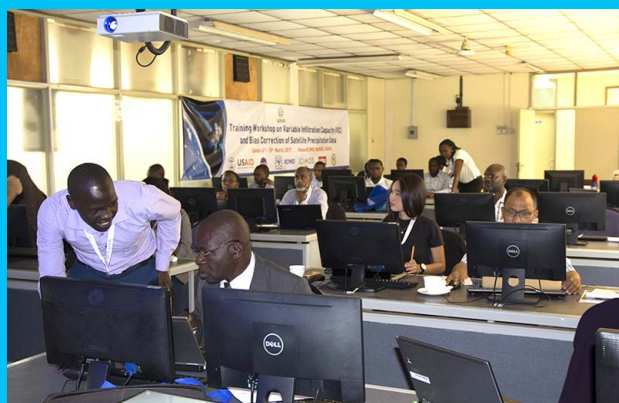
RCMRD Hosts Training to Enhance Water Resources Management.