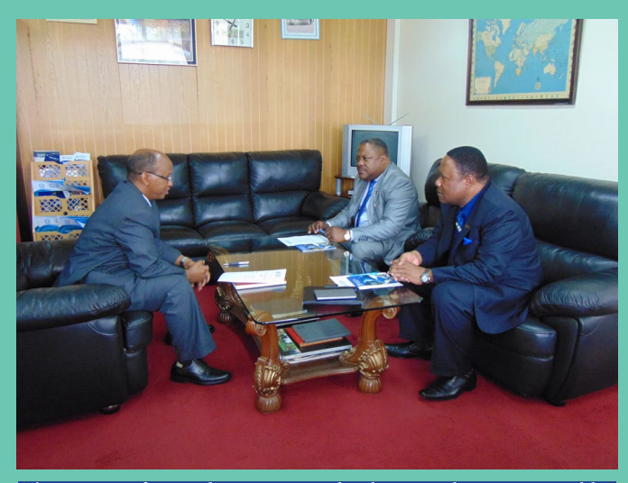
The Minister for Lands, Housing and Urban Development, Republic of Malawi visit to RCMRD