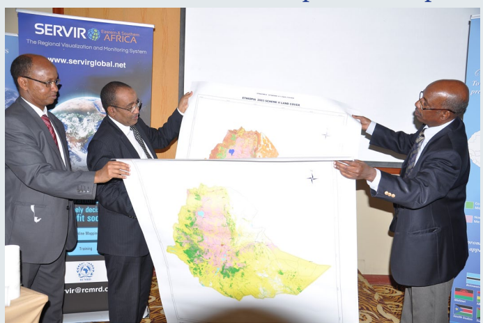
Minister of Environment and Forest, Ethiopia receives Land Cover maps

RCMRD conducted a three-day Land Cover Data Dissemination and Technical Training Workshop from 1st-3rd April, 2015, in Ethiopia.