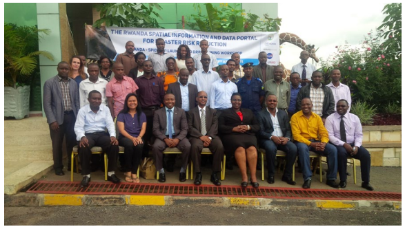
The launch of the Rwanda web portal in Kigali

The portal was developed with support from Regional Centre for Mapping of Resources for Development (RCMRD).