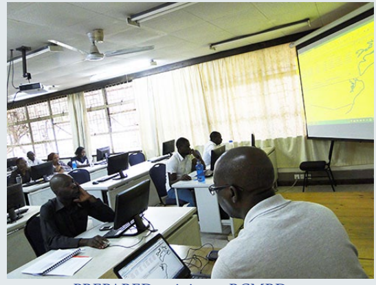
PREPARED training at RCMRD

PREPARED is being implemented in Kenya, Tanzania, Uganda, Burundi, and Rwanda and addresses three main East Africa Community challenges,