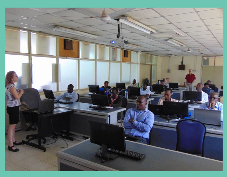
Workshop on Open Source Land Cover Change Mapping & GHG Uncertainty Estimation and Forest Connectivity-Carbon Co-benefits Mapping