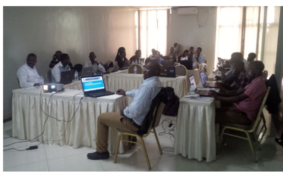
Participants go through the portal functionalities

Seraphine Mukantabana, Rwanda's minister for disaster management and refugee affairs, said most disasters in the country take the form of small scale events that do not require massive national or international respons- more here.