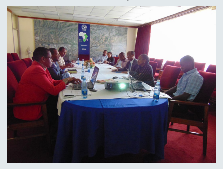
RCMRD meeting with the Wajir County Government officials

The project started in September, 2014 and is expected to end in July, 2015.