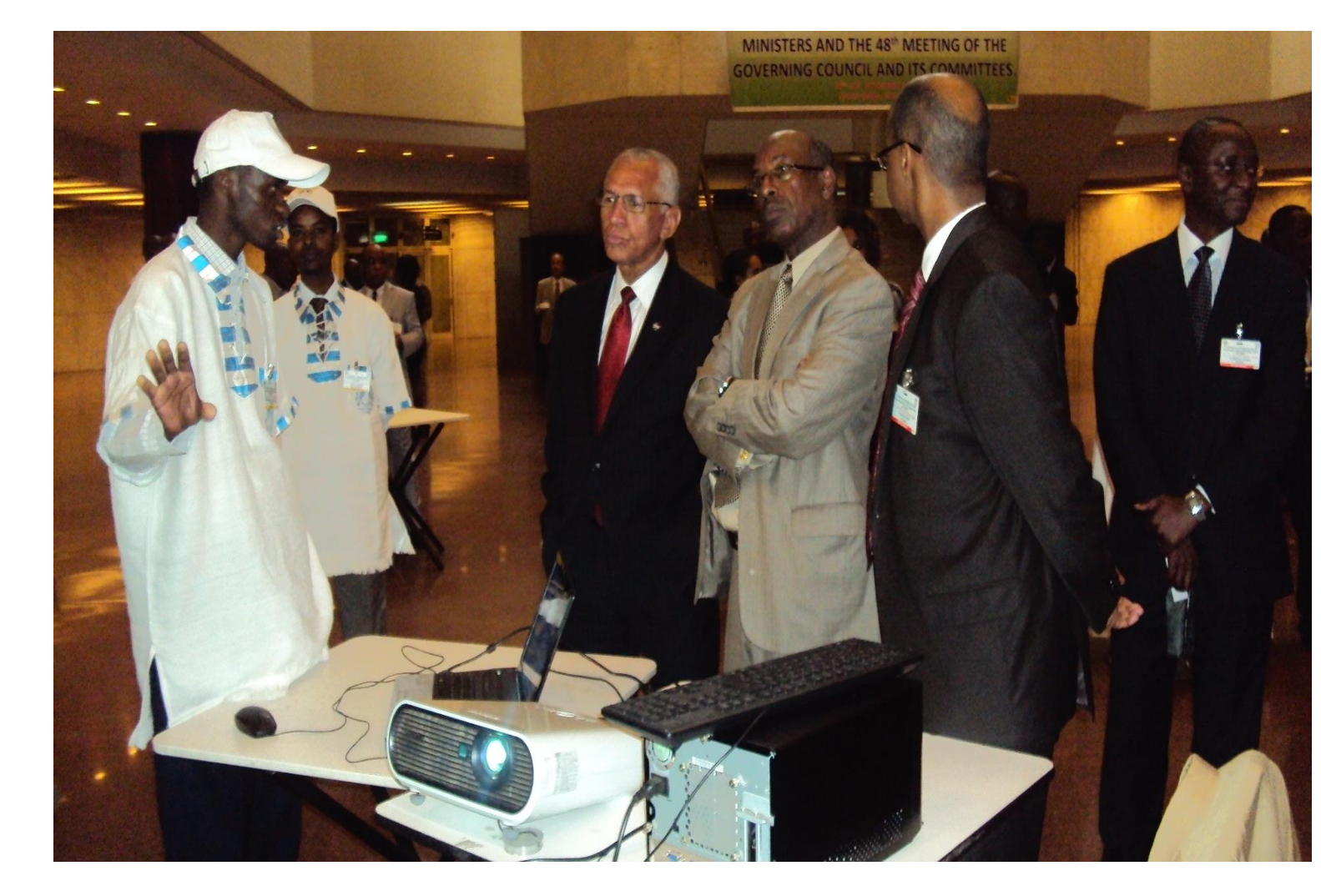
The launch of Ethiopian Mapping Agency Web GIS Portal in Addis Ababa during the Conference of Ministers