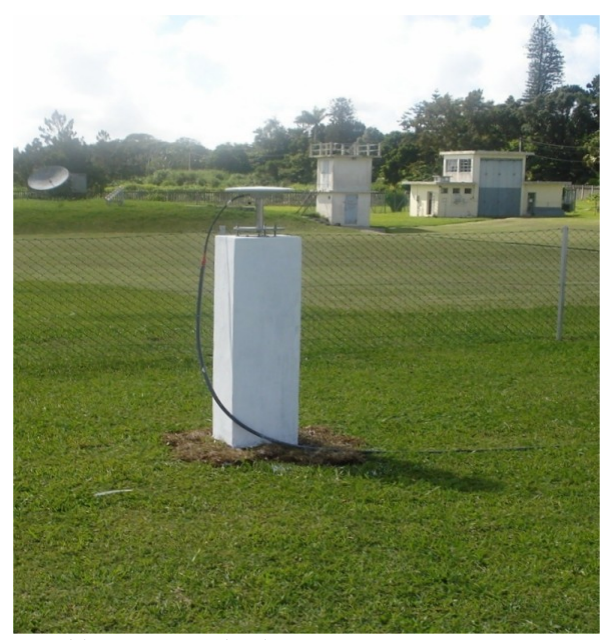
Mauritius CORS station in Vacoas

A new GPS Continuous Operating Reference station was installed in Mauritius in begin of April 2008. This station is located at Vacoas, at the headquarters of the Mauritius Meteorological Services (MMS). This station was installed in the framework of a collaborating project between MMS, which is hosting the equipment, JPL/UNAVCO (USA), which provided the equipment, and Center of Geophysics of the University of Lisbon (CGUL, Portugal), which supported the installation. The receiver is a Trimble NetRS with a Zephyr Geodetic Antenna. The data (acquired at 1s rate) will be made freely available through CDDIS (ftp://cddis.gsfc.nasa.gov/pub/gps/data/). Further information about this station can be obtained from Rui Fernandes (rmanuel@di.ubi.pt).