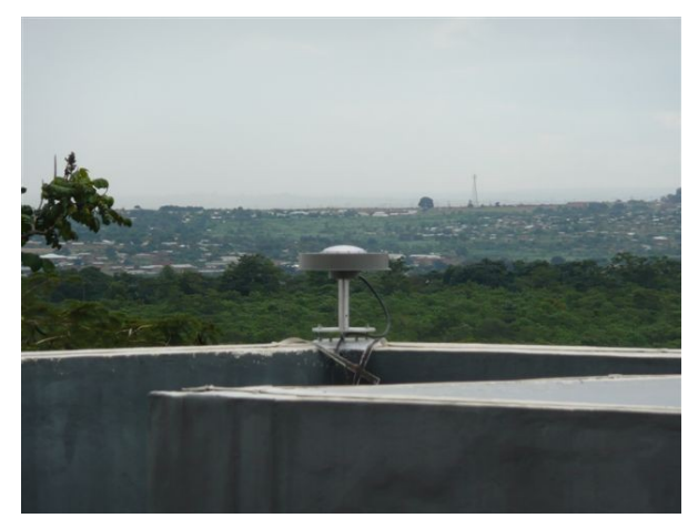
Panoramic View of CORS station in Lilongwe

The Department of Land Survey intends to expand the network by installing more stations in the north and south of the country in order to properly cover the entire country with a modern mapping system. For further information on the station please contact Mr Mikael Mzunzu of Malawi Departs of Land Surveys (mzunzumtt@malawi.net)