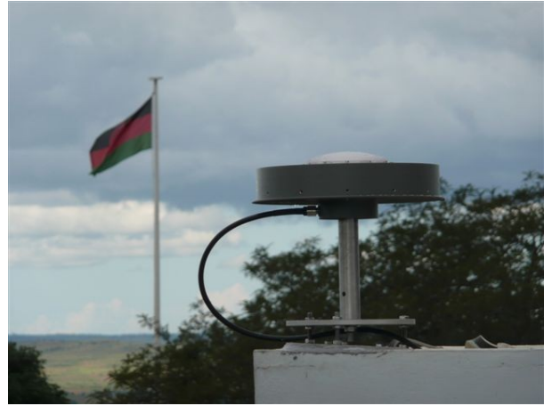
Malawi CORS station in Lilongwe

The first GPS (Global Positioning System) Continuous Operating Reference station of Malawi was installed on 9<sup>th</sup> April 2008 in Lilongwe. This project was initiated and is managed by the Department of Land Surveys, Ministry of Lands and Natural Resources. The installation was done with the support of Hartebeesthoek Radio Astronomy Observatory(HartRAO) Space Geodesy Programme of South Africa, which funded the equipment, and with the technical collaboration of University of Beira Interior / Instituto D. Luíz (UBI/IDL) from Portugal. This station is located at Capitol Hill, in the building of the Ministry of Home Affairs and Department of Human Resources, which are also supporting the project.